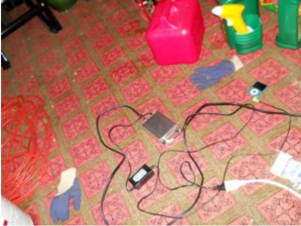
System set up in a garden shed. (Low-pass filter is out of frame.) And that's not a gas can, that would be a bad idea near electronics. It's weed killer.

Some people have been known to camouflage an antenna inside of PVC pipe, which does not attract as much attention on a roof as an naked antenna on a roof. This is because roofs, especially in cities, often have various tubes and pipes sticking out of them. The PVC will not cut down much on transmission power, but it will protect the antenna from the elements.