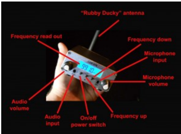
Controls on the transmitter.

The power cable on these transmitters is too short, like less than two feet. You may need an extension cord, but you probably already have one.