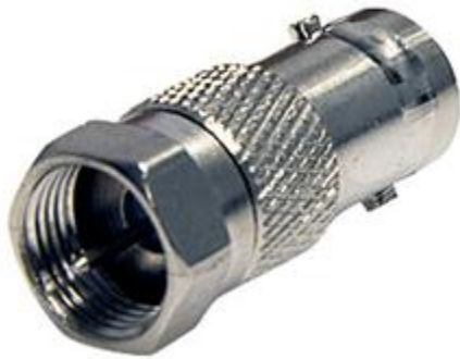
$8 StarTech BNCCOAXFM BNC to F Type Coaxial Adapter F/M