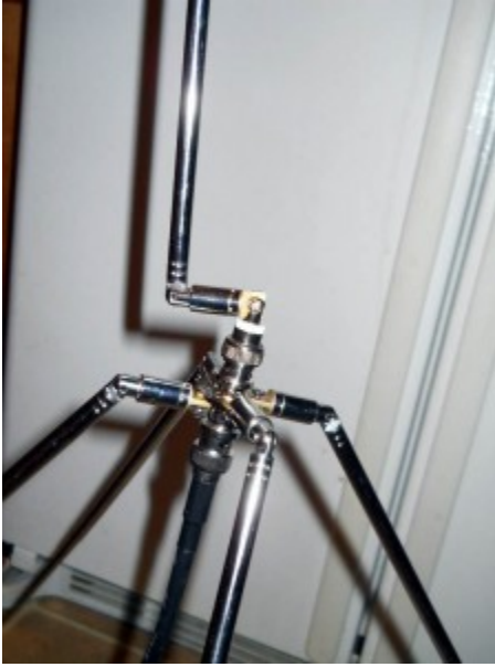
Close-up showing assembled antenna.