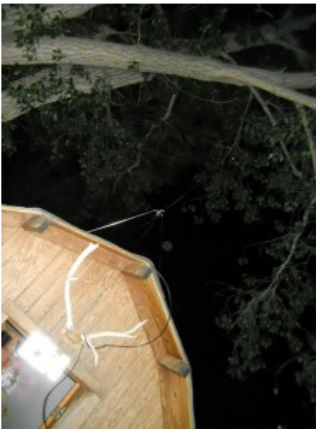
Antenna on the roof of a garden shed. An actual "radio shack!"

You'll get greater range if you have a good \frac{1}{4} wave antenna vs. the rubber ducky. And greater range if your antenna is properly tuned, and if you can get it up as high as possible. An antenna outside a house will have better range than an antenna inside a house. An antenna on top of the house is best, though it could attract attention.