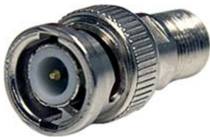
$8 StarTech BNCCOAXMF BNC to F Type Coaxial Adapter M/F