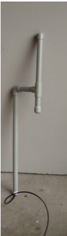
Rubber ducky antenna inside a PVC housing.

Some people have been known to camouflage an antenna inside of PVC pipe, which does not attract as much attention on a roof as an naked antenna on a roof. This is because roofs, especially in cities, often have various tubes and pipes sticking out of them. The PVC will not cut down much on transmission power, but it will protect the antenna from the elements.