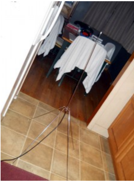
Antenna set up in a house.